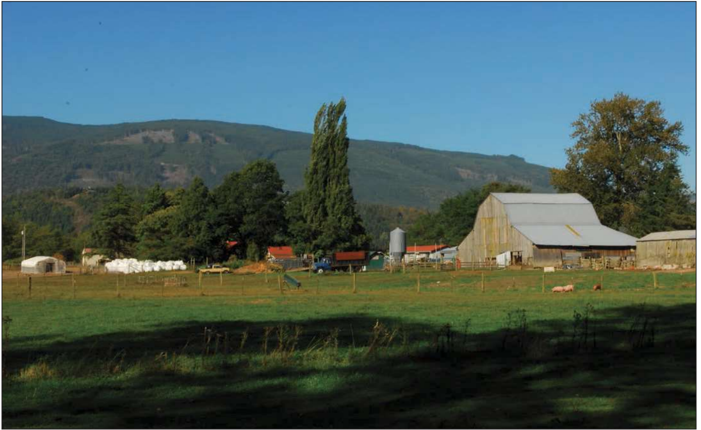
Skagit River Ranch has received awards for soil, water and woodland conservation.

for rotation. During spring and summer, animals are moved to fresh pasture almost daily. Rotational grazing is a lot of work, but George asserts that it is worth it because it helps break up the parasite cycle in the soil while allowing the animals to graze the most nutritious parts of the plants.