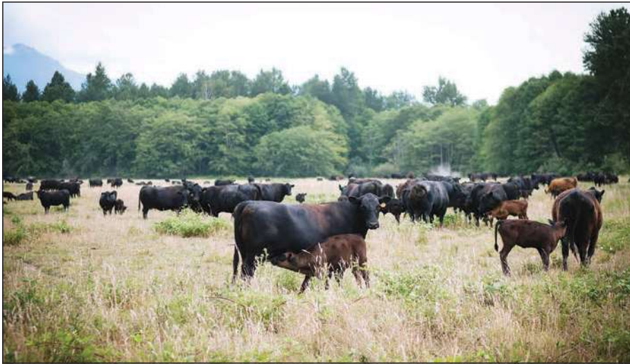
Skagit River Ranch Wagyu-Angus on grass. The ranch raises about 200 head annually.

grazing on grass and gleaned insects. The pens are placed near shelters that house nest boxes where their eggs are laid and gathered. Their eggs have earned the Cornucopia Institute's highest ranking for organic eggs, and are so popular that customers line up half an hour before opening time at farmers' markets to buy them because the eggs quickly sell out.